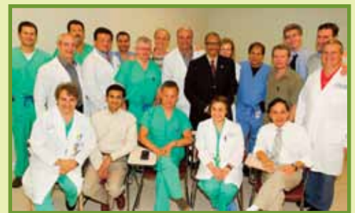
Members of New Jersey Anesthesia Associates come together in support of Saint Barnabas Medical Center

An extremely generous $2,000,000 pledge from New Jersey Anesthesia Associates will help Saint Barnabas Medical Center obtain a state-of-the-art anesthesia information management system to enhance patient care.