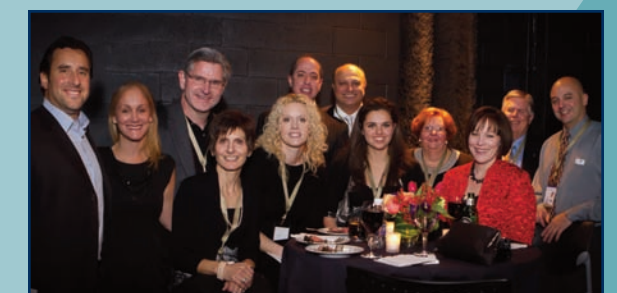
Medical Staff Officers and guests attend the Bocelli cocktail reception.