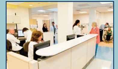
Fast Track prepares to welcome patients.

Thanks to the generosity of several donors the Saint Barnabas Emergency Department Fast Track recently underwent a major renovation and expansion. Doubling the size of Fast Track will result in faster triage, registration, and testing for adults and children with a variety of emergency medical needs. This wonderful new facility includes private rooms for stitches and other procedures where added privacy is just what the doctored ordered.