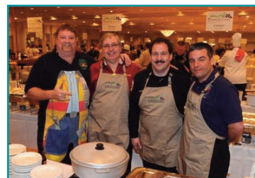
Members of North Hudson Fire and Rescue serve up a delicious dish at the 1 st Annual Cooked and Uncorked Food and Wine Festival.

Saint Barnabas Burn Foundation teamed with the New Jersey State Firefighter's Mutual Benevolent Association at the 1 st Annual Cooked and Uncorked Food and Wine Festival. More than 40 restaurants and over 100 wine and spirits sellers from throughout New Jersey donated their talent and tasty specialties in the name of burn prevention and burn education.