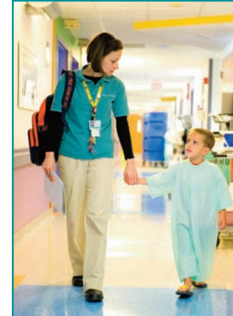
A Child Life Specialist accompanies a young patient to surgery.

At Saint Barnabas Medical Center, our Child Life Department reduces the anxiety, stress, and loneliness of hospitalization. Hospitals like Saint Barnabas have long recognized the importance of Child Life programs which are vital to pediatric well-being. Our Music Therapist, Art Therapist, and Child Life Specialists combine therapeutic play, psychological preparation, education, and emotional support to make hospitalization easier for sick and injured children.